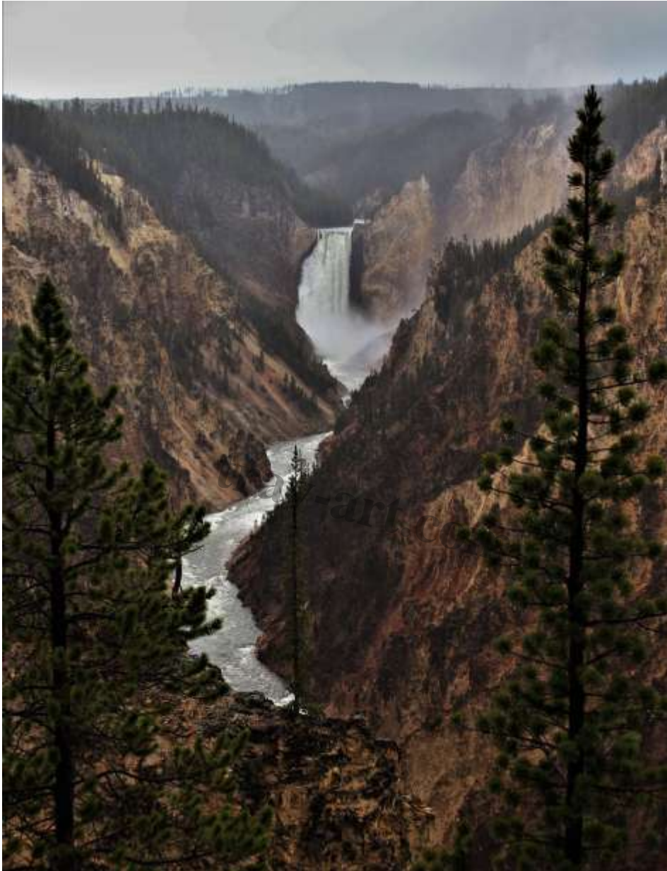
Grand Canyon of the Yellowstone with Lower Falls

Though it was lightly raining when we arrived on the south rim, it wasn't enough to deter us from going to Artist's Point for photos. This is just one of the iconic places in the west and truly a sight to behold. Had the weather been better we would have hiked a few of the trails.