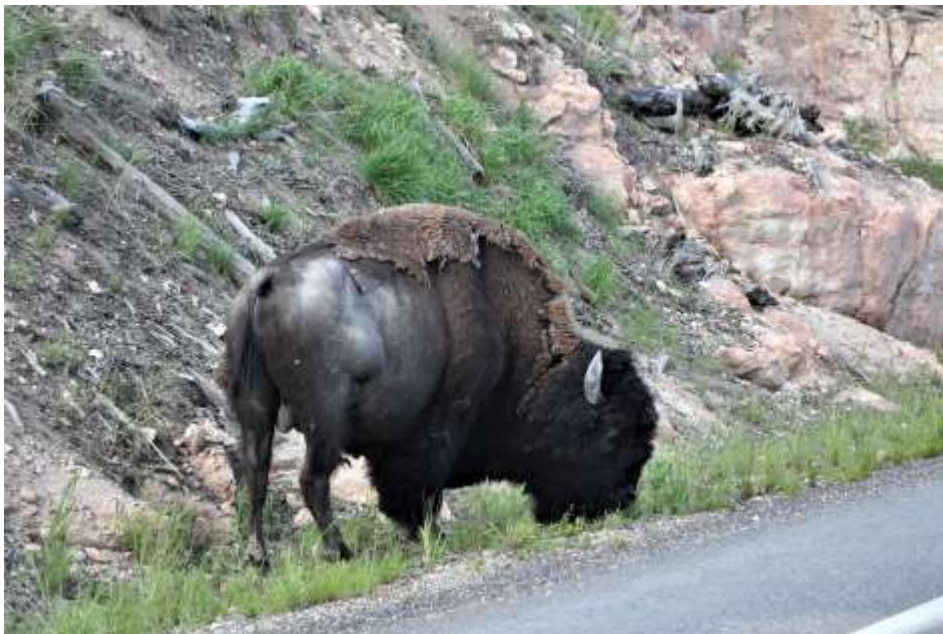
Bison along the roadway

Following the trail ride we ate at the Raven Grill in Gardiner, MT which closed a couple months after our visit. It was only ok and I wouldn't have recommended it.