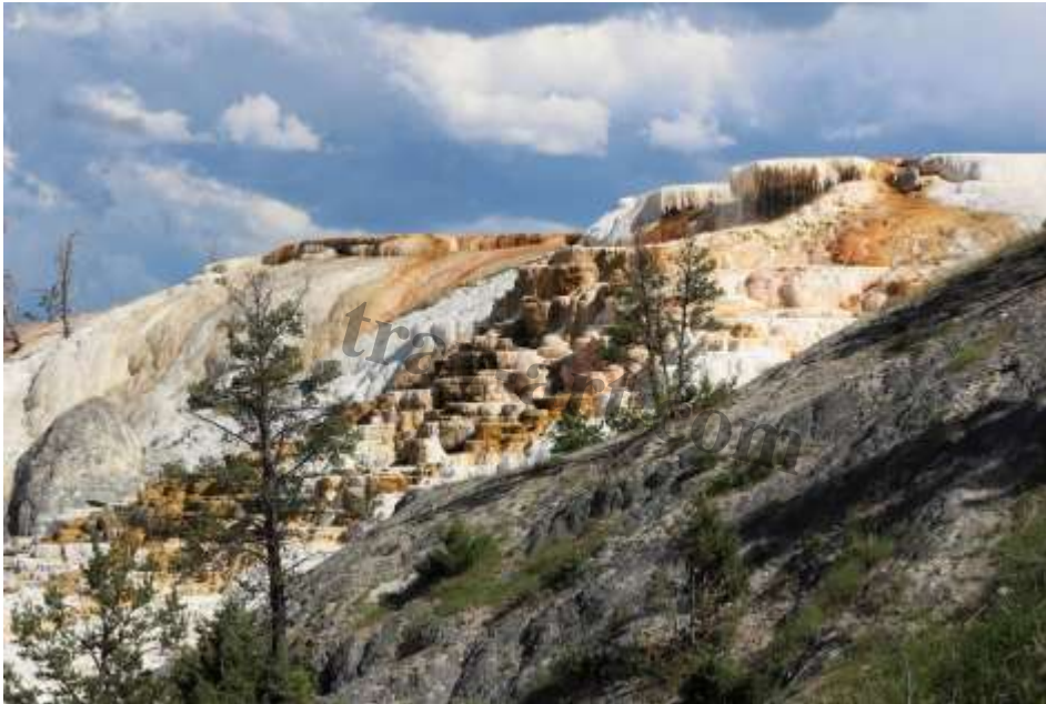
Mammoth Hot Springs from Beaver Ponds Trail

First my kids bailed on the hike. It's kind of hard to just continue on when the rest of your family decides the hike is too long and the weather too hot (the sun had come out and it was a very humid 80F+ degrees). Second the mosquitoes were starting to bite and that was understandable. Always bring lots of repellent to Yellowstone.