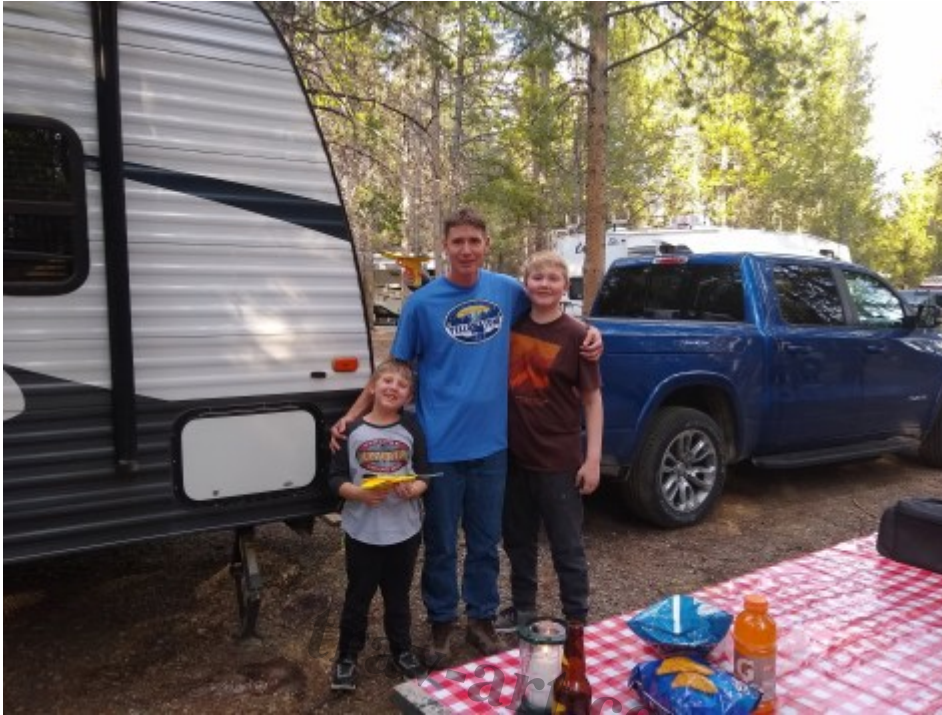
Campsite at Colter Bay RV Park

As far as national park campgrounds go, this is the very best. The sites are full hookup (which is very rare in national parks) and you are not in an RV parking lot like so many other RV campgrounds. It's full of trees and you can walk over to the marina, visitor center, and directly to trails along the lake. You might not get very good WIFI if you need it, but you generally don't expect this in national parks. This would be the last camping trip with this camper which I'll discuss in another post specifically about RVs.