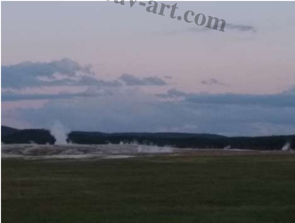
Yellowstone as dusk approaches