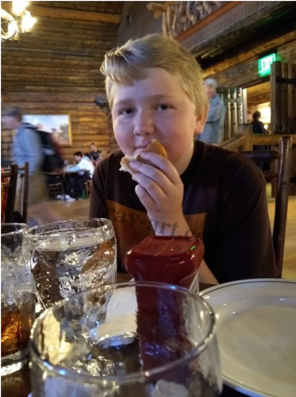
Old Faithful Inn Dining Room

The food is a giant buffet, but it is very high quality and the servers are always friendly as well. It's fun to just look around the room at all the twisted logs that were used in its construction.