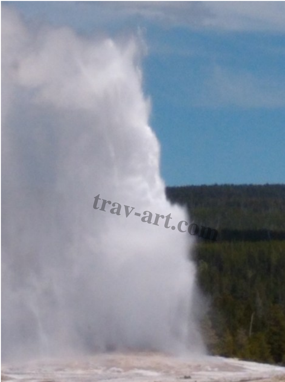
Upper Geyser Basin

We watched Old Faithful erupt and then hiked the Overlook trail to view the entire area including Old Faithful Inn. We walked along the boardwalks and saw a number of hot springs before making our necessary stop at the grand old lodge.