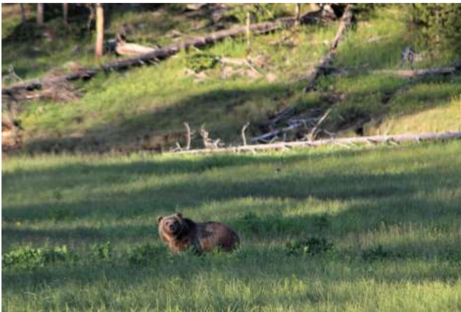
Grizzly in Yellowstone meadow

We were the first to spot the bear and pulled over. As other cars passed they stopped as well and soon a bear jam formed along the roadway.