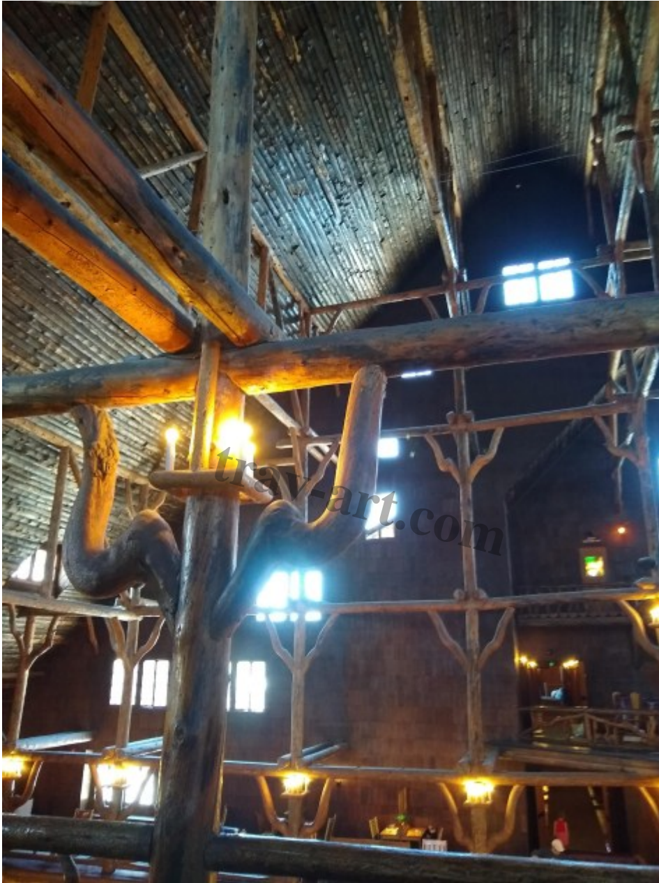
The Old Faithful Inn

Another tradition we have after three family trips to Yellowstone is to eat in the dining room, and of course we did that.