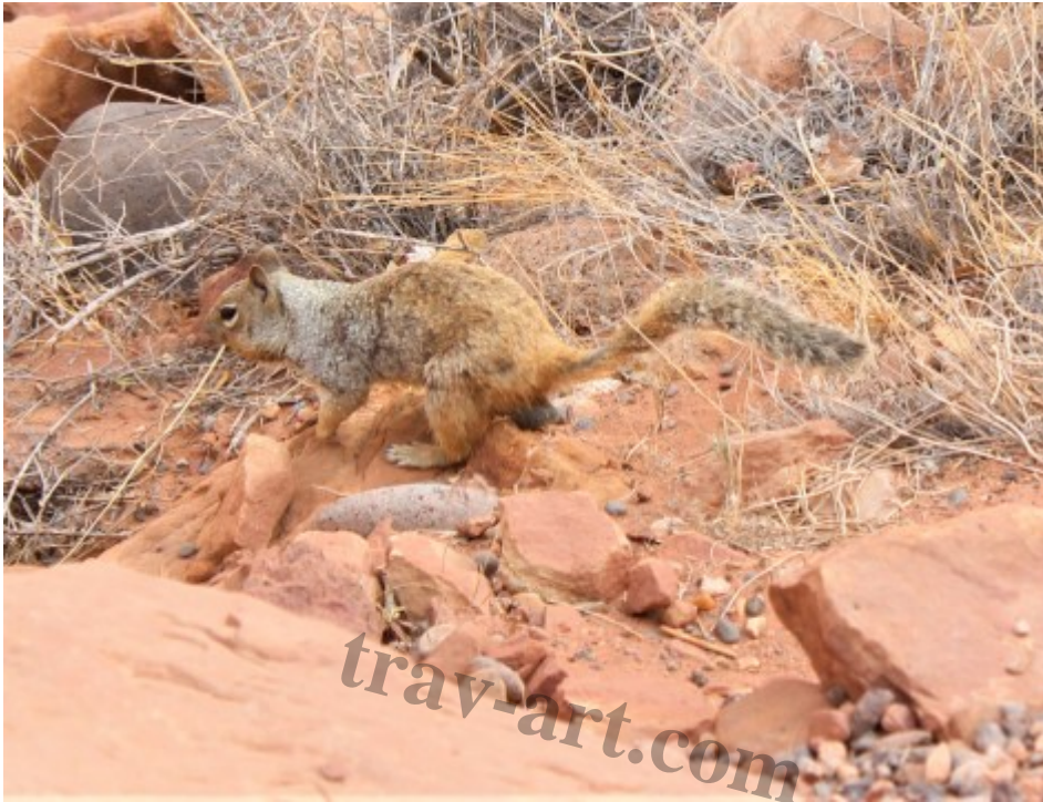
Rock Squirrel, Capitol Reef NP