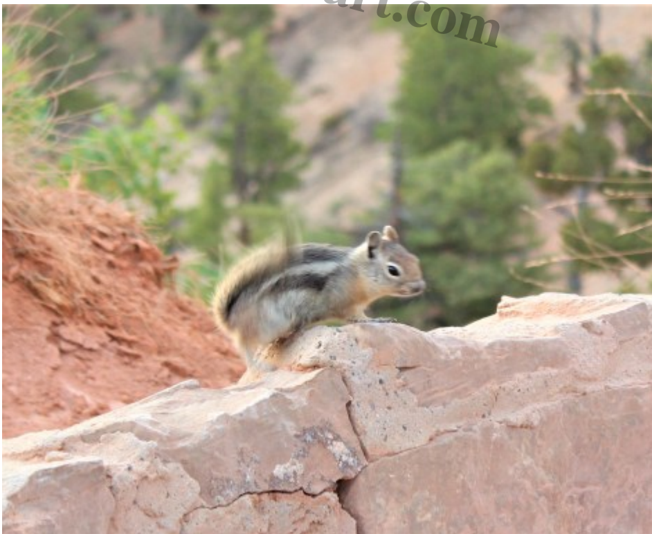
Golden Mantled Ground Squirrel, Capitol Reef