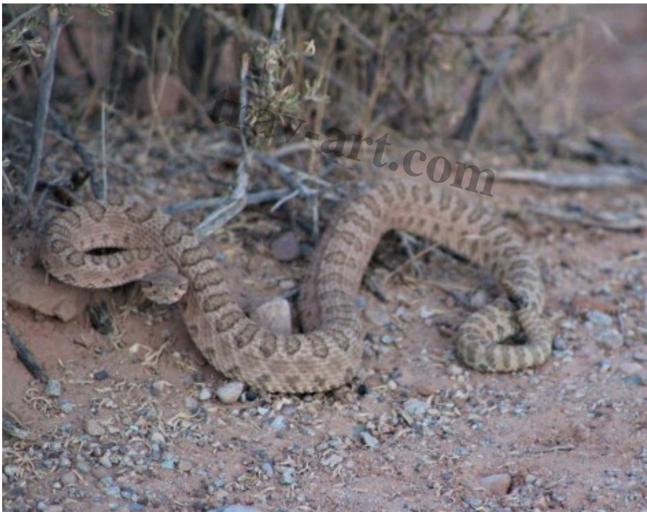
Midget Faded Rattlesnake, Arches NP