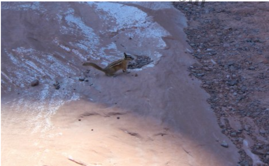
Uinta Chipmunk, Arches