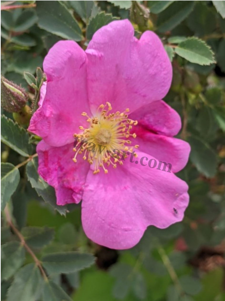
Woodâ??s Rose, Bryce Canyon