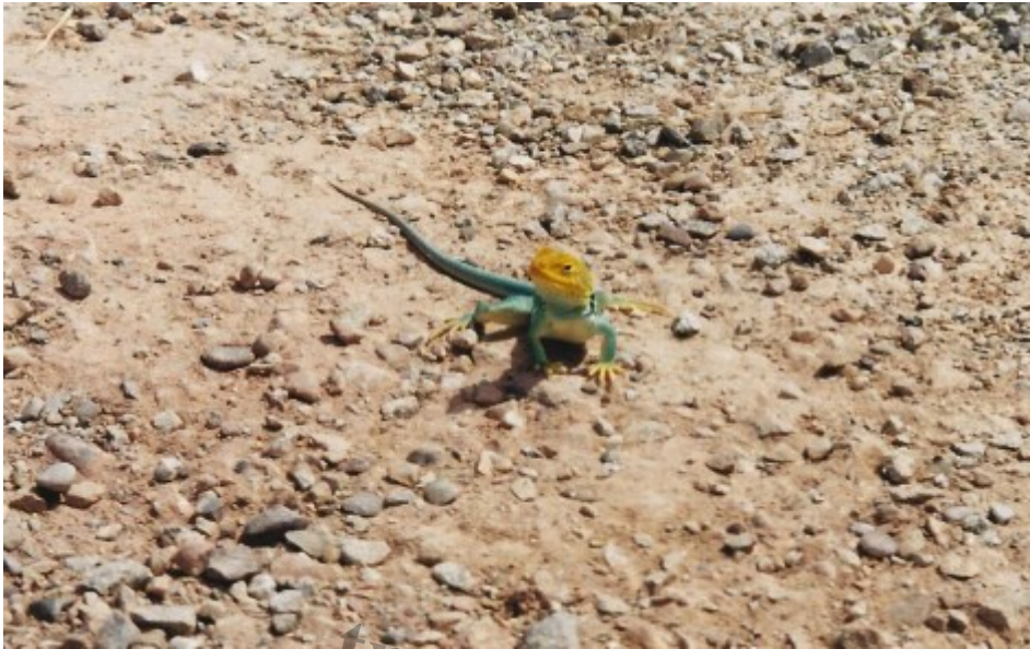
Collared Lizard, Arches NP