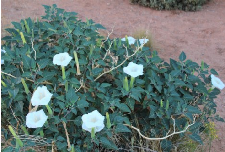
Devil's Trumpets, Arches NP art.com