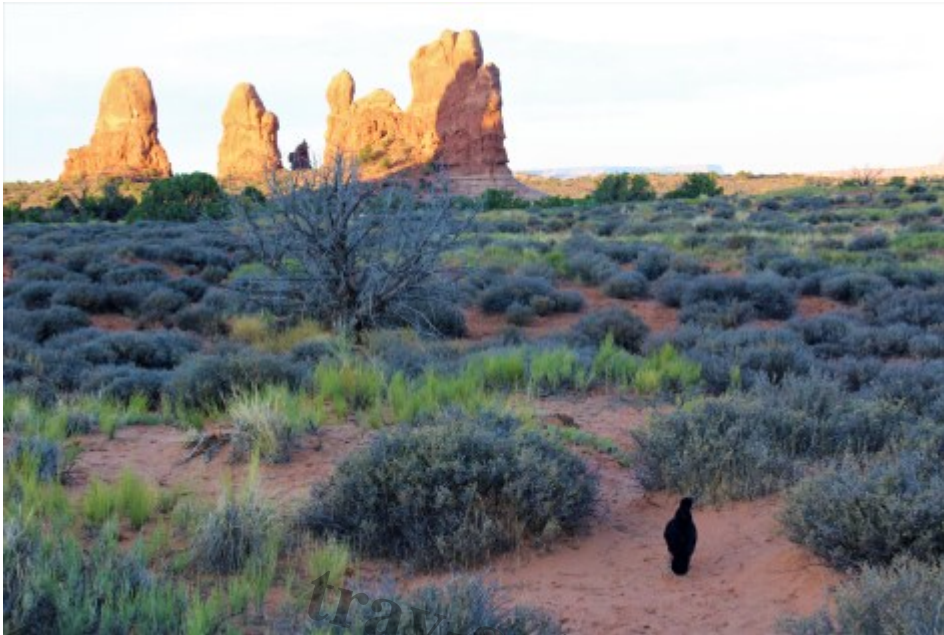
Raven, Arches NP