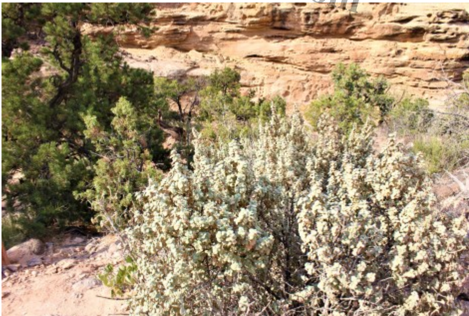
Roundleaf Buffaloberry, Capitol Reef NP