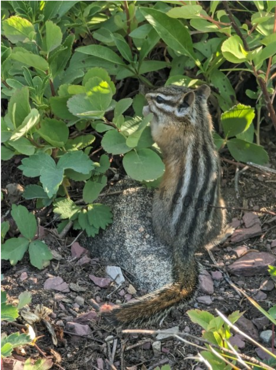
Yellow Pine Chipmunk, Glacier NP