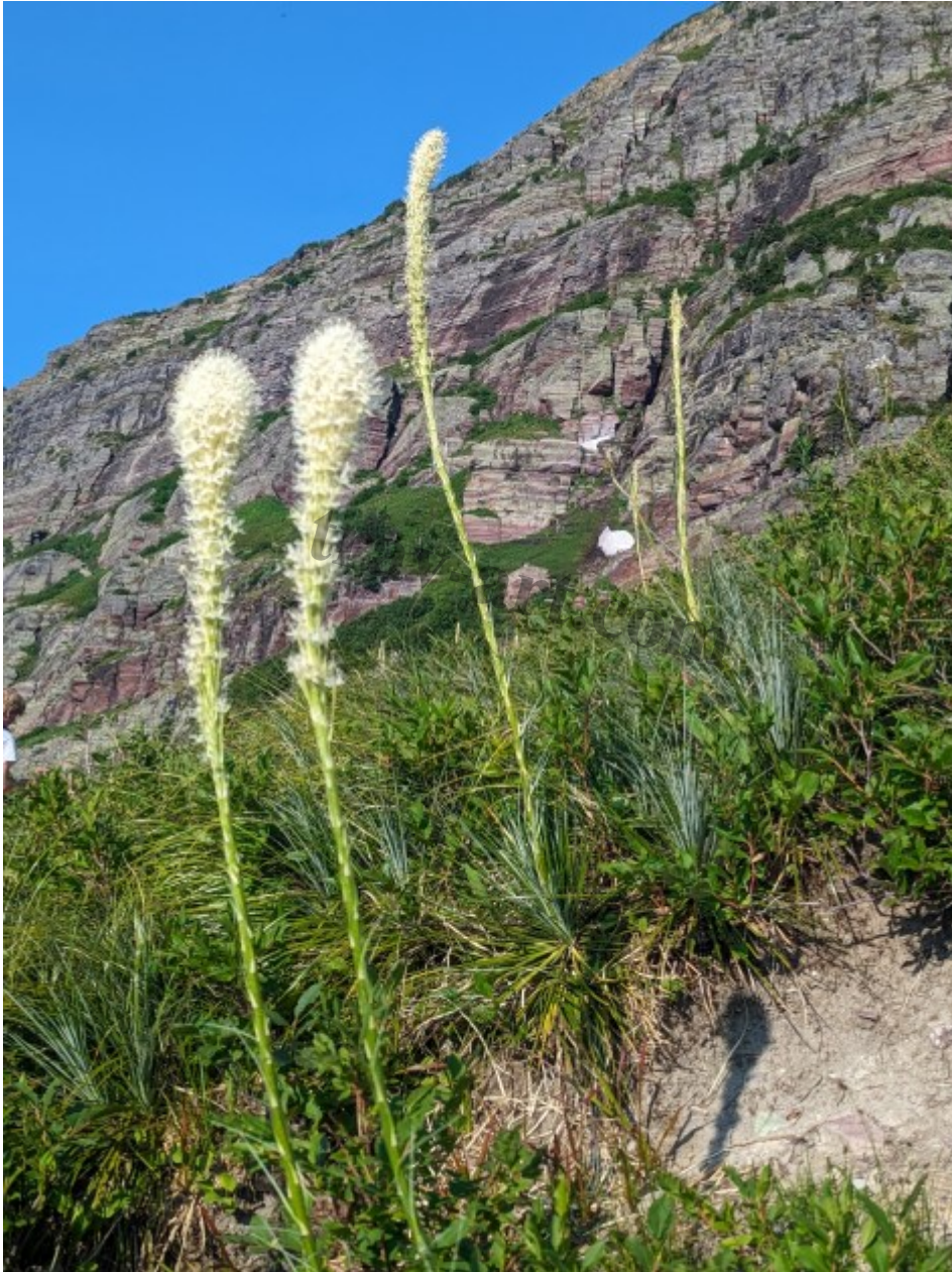
Beargrass, Glacier NP