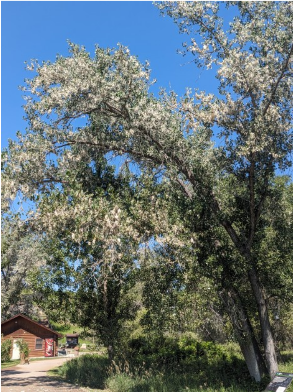
Eastern Cottonwood, Pompey's Pillar NM