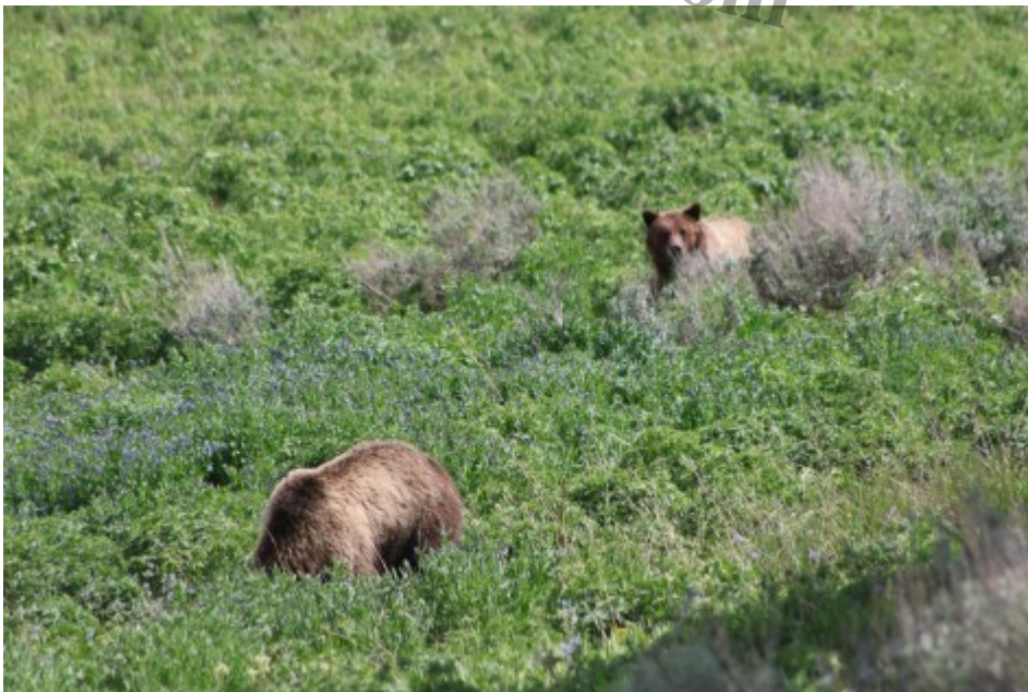
Grizzly Bears, Beartooth Mountains