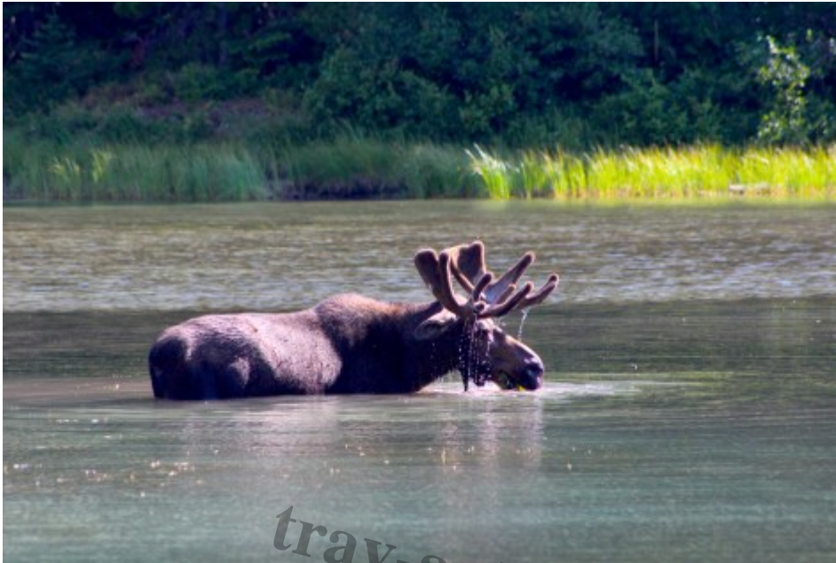
Bull Moose, Glacier NP