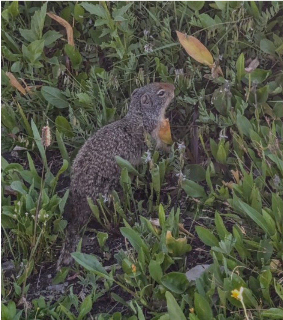
Columbian Ground Squirrel, Glacier NP