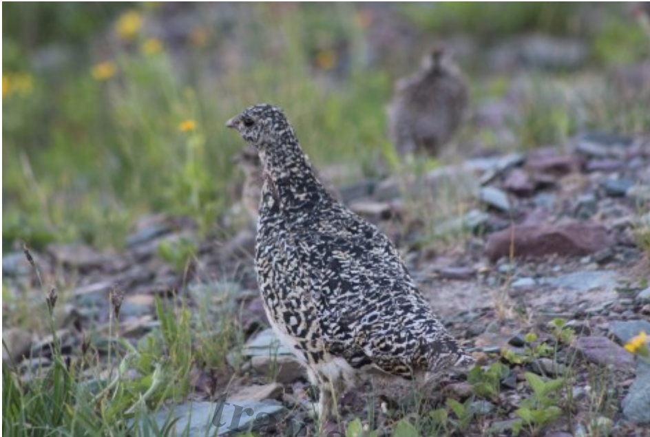
White-tailed Ptarmigan, Glacier NP