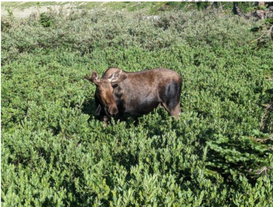
Moose Cow, Glacier NP