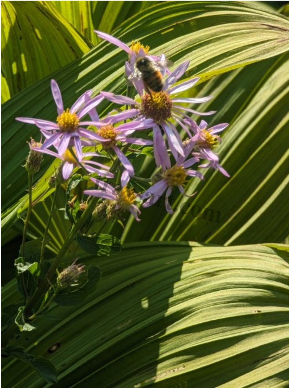
Aster and Bumblebee, Glacier NP