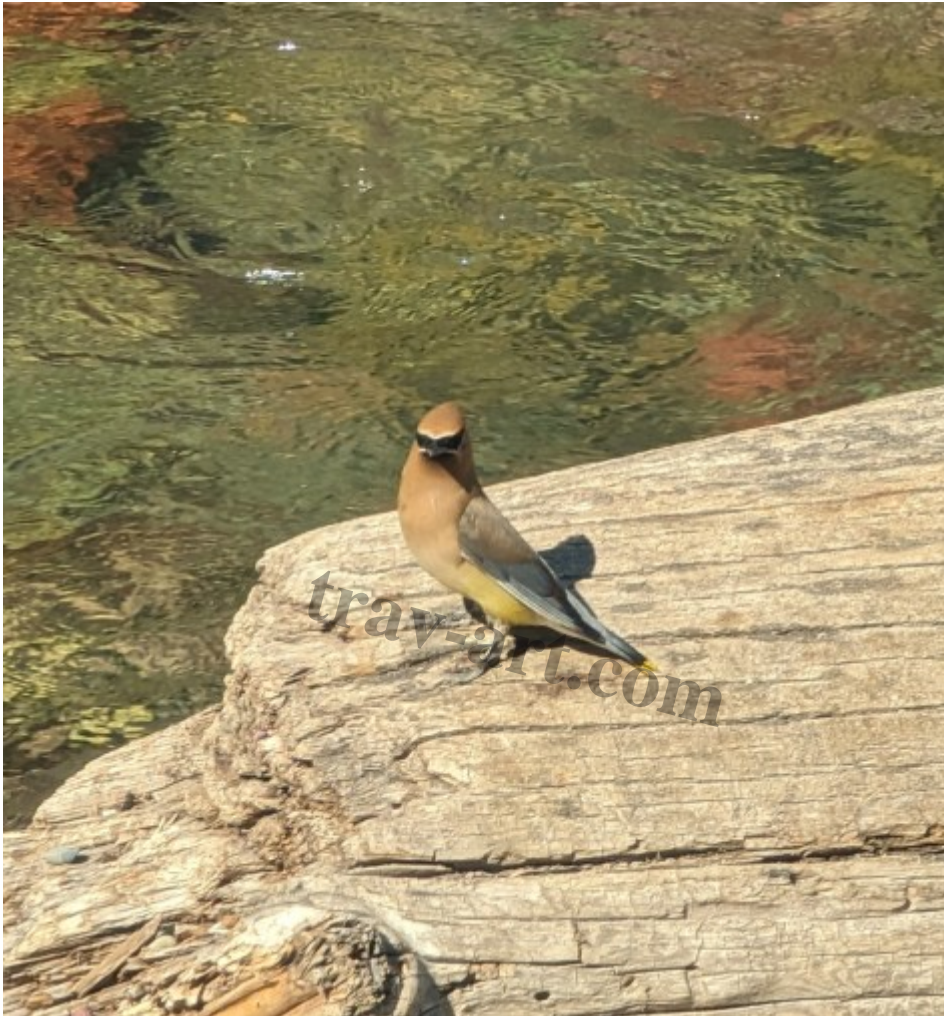
Cedar Waxwing, Glacier NP