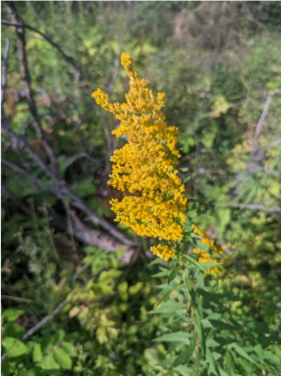
Canada Goldenrod, Columbia Falls