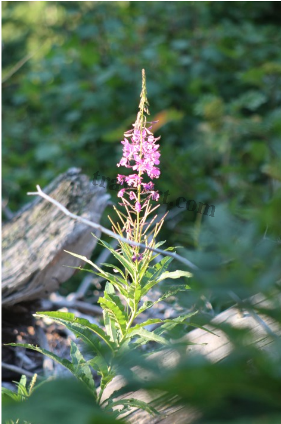
Fireweed, Glacier NP