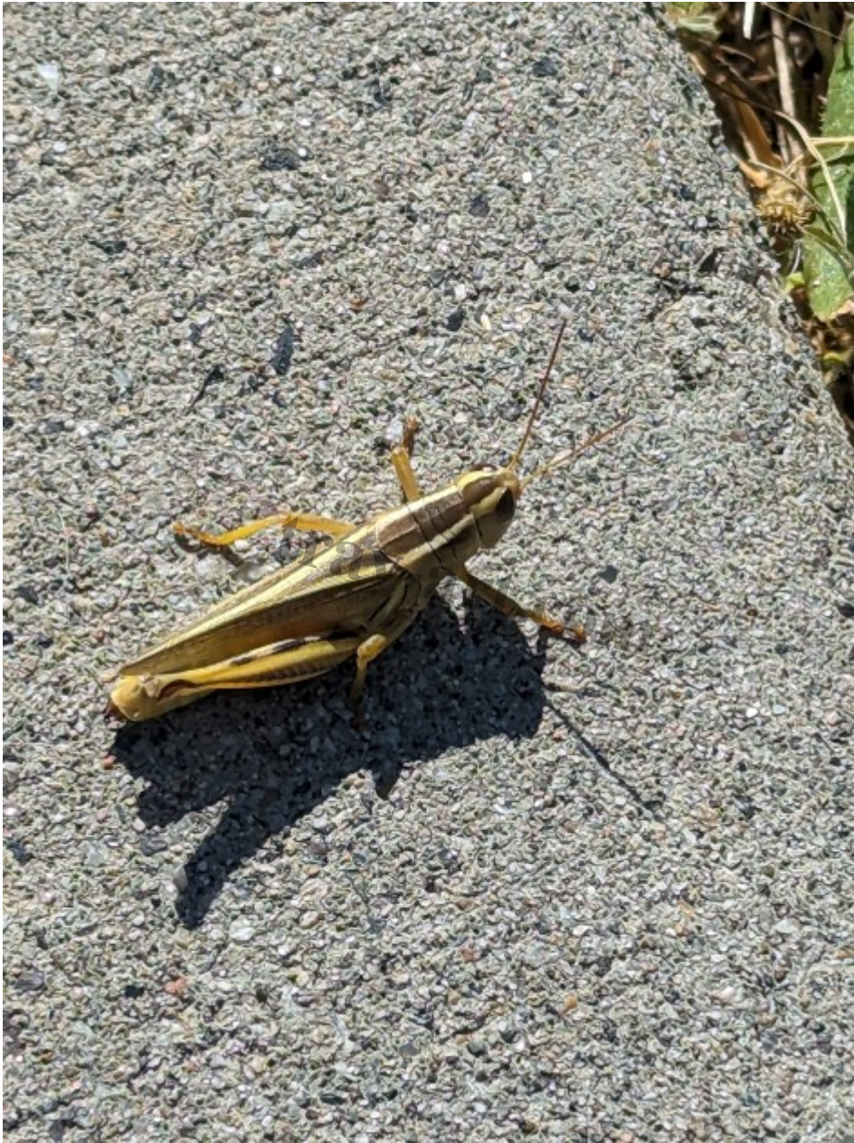
Two-striped grasshopper, Pictograph Cave SP