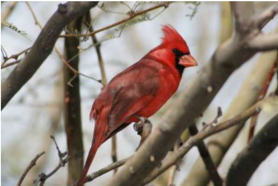
Northern Cardinal, Sonoran Desert