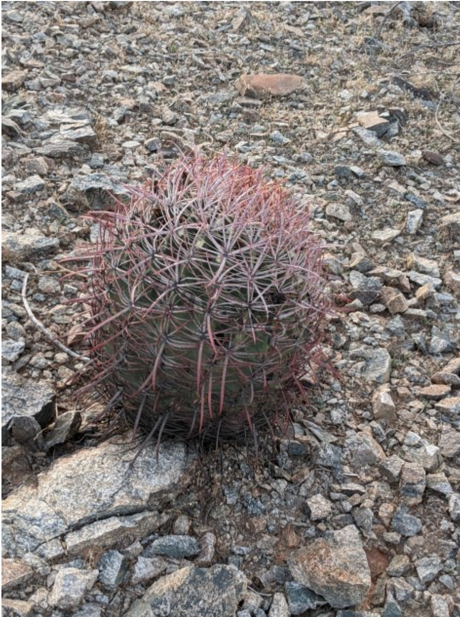
Barrel Cactus, South Mountain Park