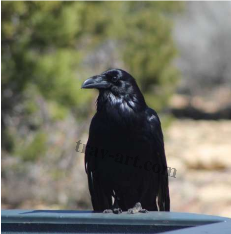
Raven, Grand Canyon