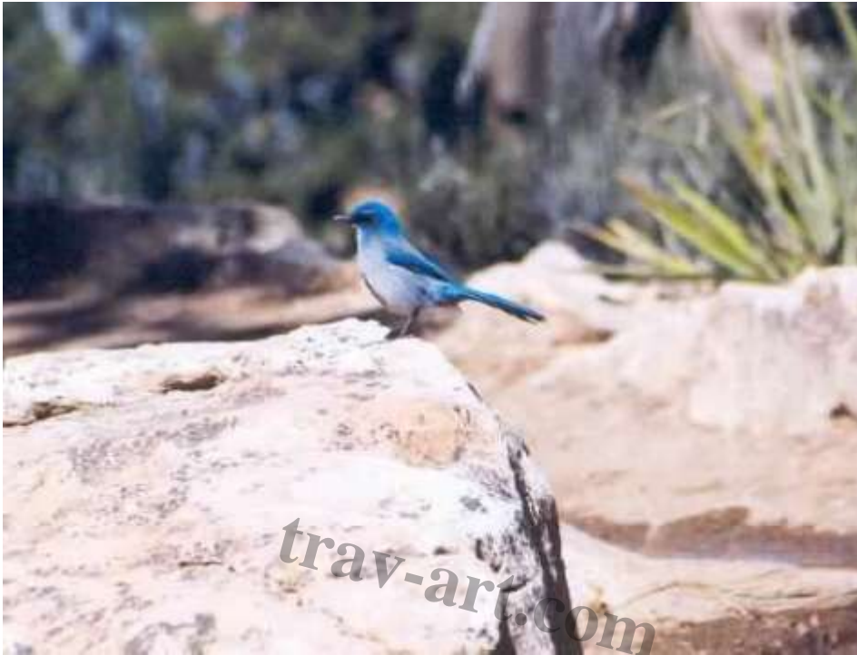
Woodhouse's Scrub-jay, Grand Canyon