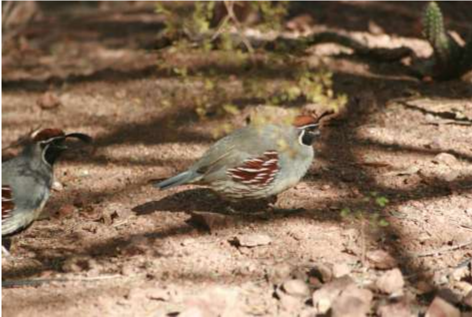
Gambel's Quail, Sonoran Desert