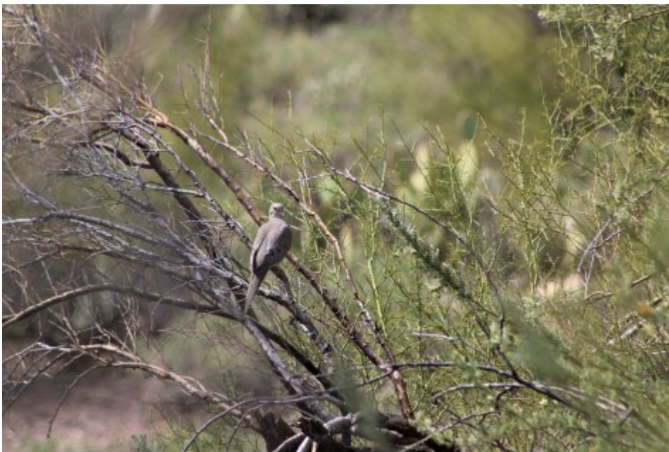
Dove on mesquite tree