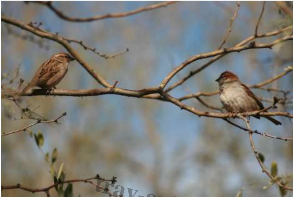
House Sparrow, Sonoran Desert