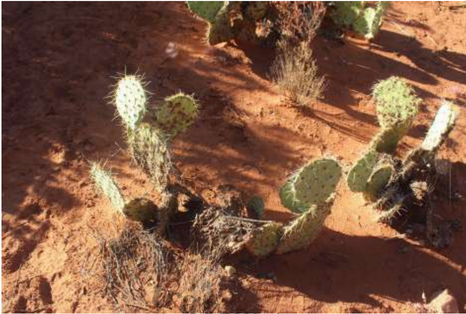
Brown-spined Prickly Pear, Sedona