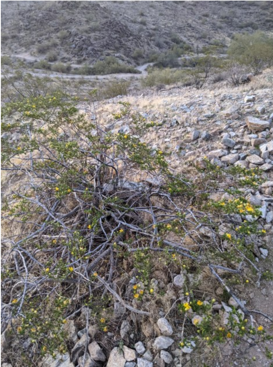
Creosote Bush, SMP