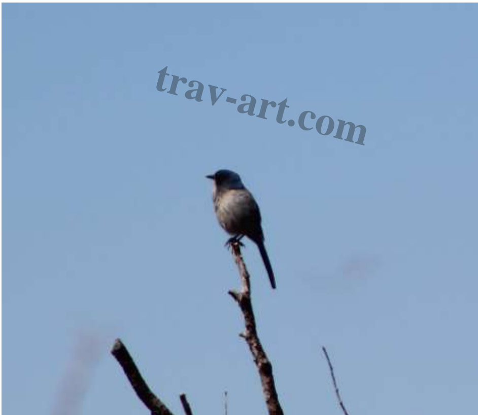
Woodhouse's Scrub-jay, Grand Canyon